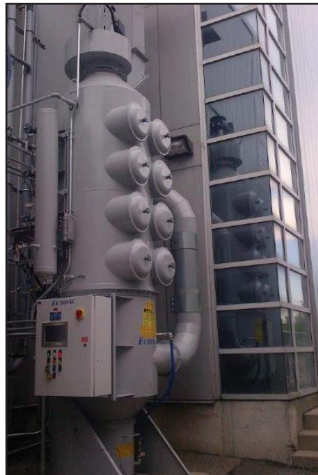
Eurovac “CFS” Cyclonic Filter Separators are used in a wide range of applications and provide the benefit of initial cyclonic separation.