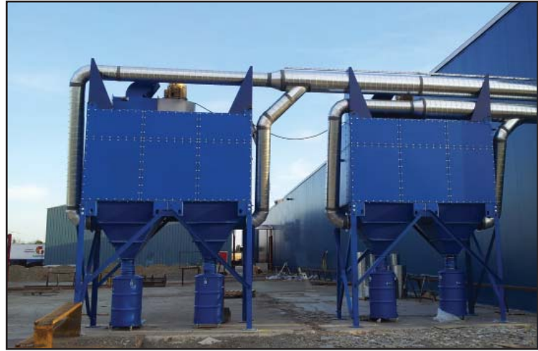
Eurovac “RCC” Rectangular Cartridge Collectors are built with a modular design and range in size from 1000 to 100,000 CFM systems.