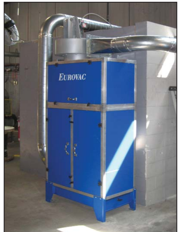
Eurovac “MDC” Modular Dust Collector systems are typically used in a welding, grinding and fume arm applications. They also fit in tight spaces.