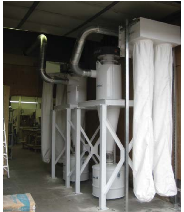
Eurovac “ABF” After Bag Filtration systems are great for smaller applications which require less CFM or require lower CFM for code requirements.