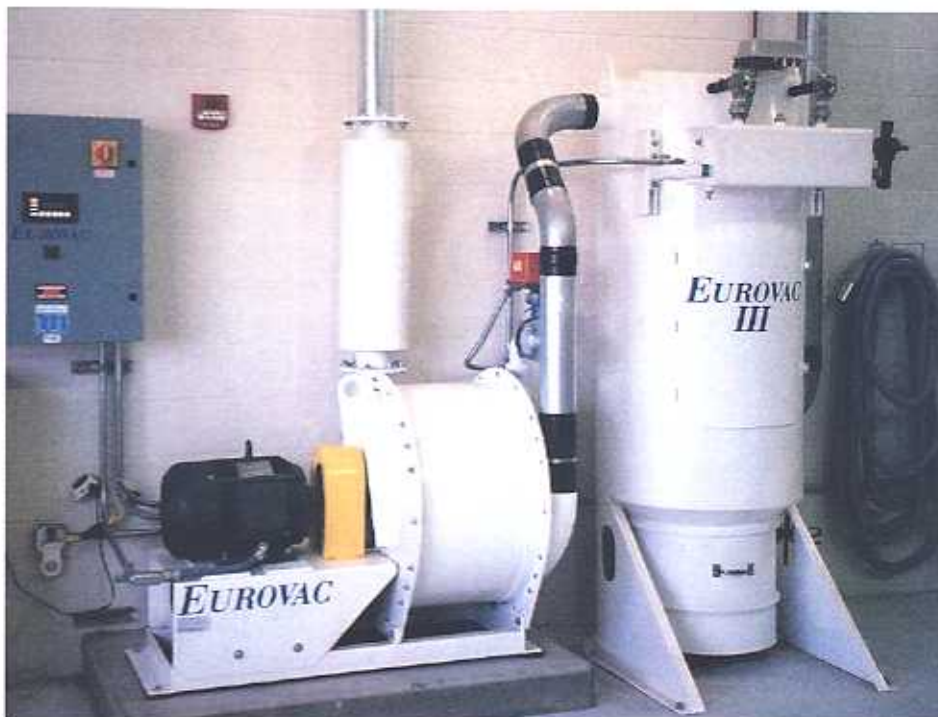
Eurovac III System with 20HP Centrifugal Multi-Stage Pump and 30" Separator.

Cleaning Tools Eurovac offers a wide range of 1-1/2" and 2" cleaning and dust extraction tools – available for both wet and dry pick-up. Custom hoods and vacuum arms, in painted carbon steel or stainless steel, are also available.