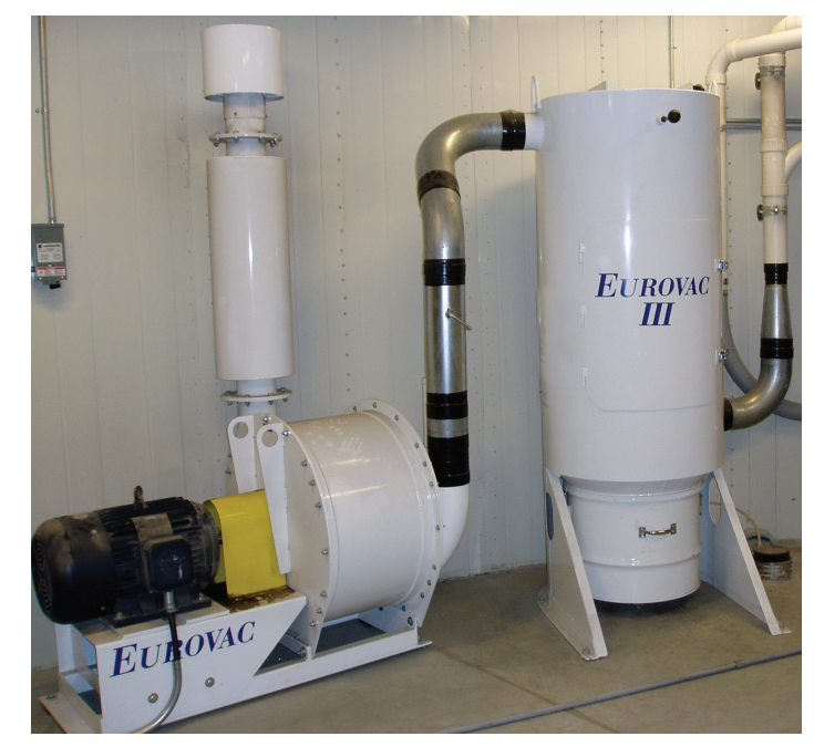
Eurovac III System