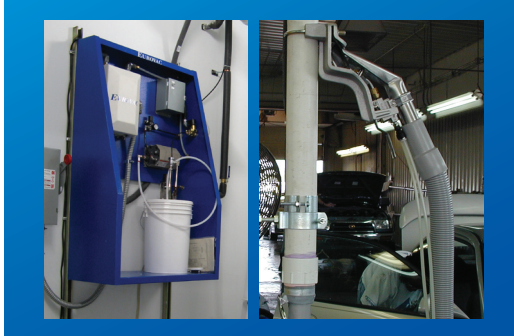
Central Hot Rug Shampoo Dispensing System