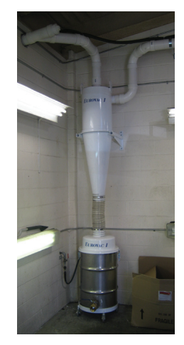
Cyclonic Wet Separator