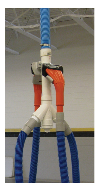
Hanging Hose Drops