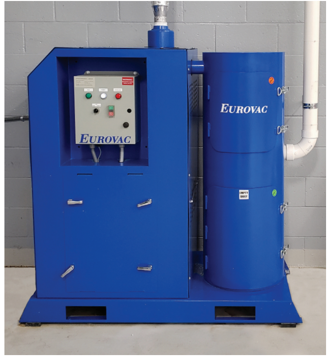
Eurovac I System