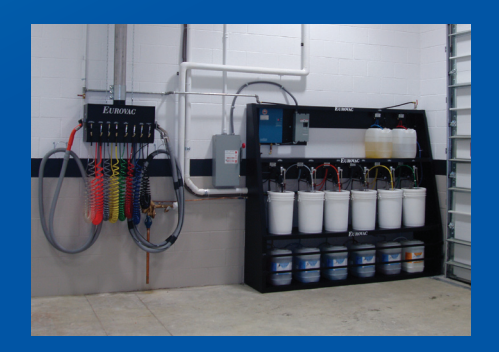
Central Chemical Dispensing System