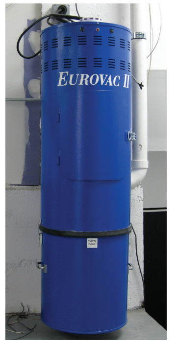
2.5HP Eurovac II - 1 Man System 5HP Eurovac II - 2 Man System