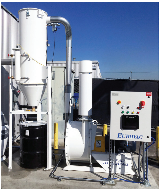
EIII 15HP - 150HP High Vacuum Systems