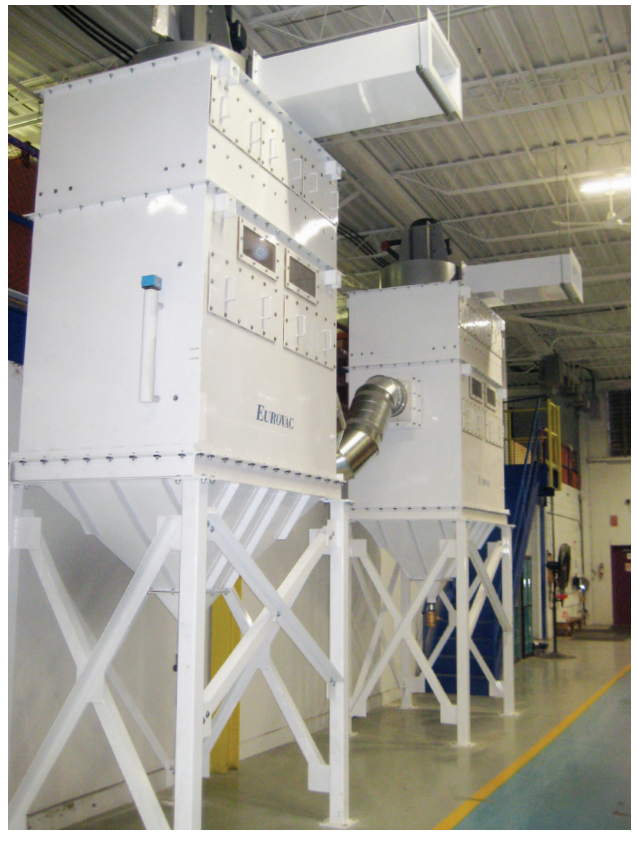
Type "B" Central Wet Collectors - Drain Valve Dust Removal