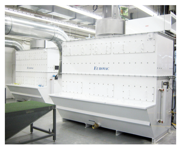
Type "A" Central Wet Collectors - Sludge Rake Dust Removal